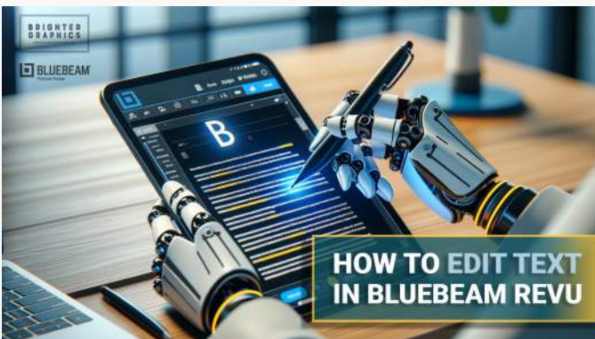
Learn how to Edit Text on PDFs in Bluebeam Revu