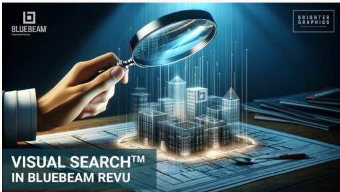
Learn how to use Visual Search in Bluebeam Revu