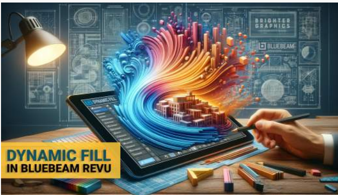
Learn how to use Dynamic Fill in Bluebeam Revu